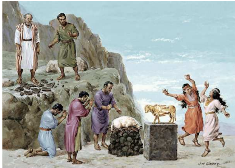
Show #33: The Israelites worship the golden calf

Aaron saw the exuberance of the Israelites for the golden calf. Then he made an altar and had it placed in front of the golden calf. It would be used to offer sacrifices to the golden calf idol that he had just made. Then Aaron said. “People, listen! Tomorrow will be a festival to the LORD!” How foolish of Aaron to do so! He knew that God alone deserved to be worshiped. He knew that God hates all idols and the practice of worshipping idols.