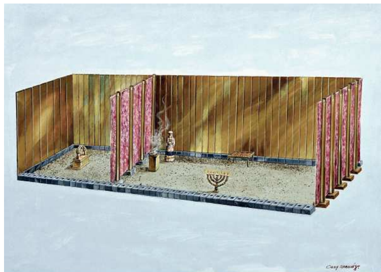
Show #35: The two rooms of the Tabernacle

The second room was called the most holy place. It was smaller than the first room. It was the most important part of the tabernacle. The most holy place was separated from the holy place by a curtain. The most holy place is the room where God resided. God forbade anyone from entering this room except a high priest who would enter it once a year.