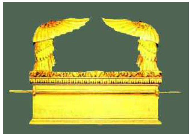
Ark of the covenant

On the mercy seat there were two cherubim made from gold, one on each end of the mercy seat facing each other. The cherubim faced each other and looked down on the mercy seat. The wings of the cherubim were made so that they stretched toward each other over the mercy seat. The stone tablets inscribed with the Ten Commandments were later placed inside the ark of the covenant beneath the mercy seat.